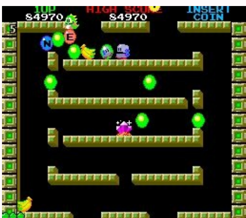
Bubble bobble lost cave rom mame.